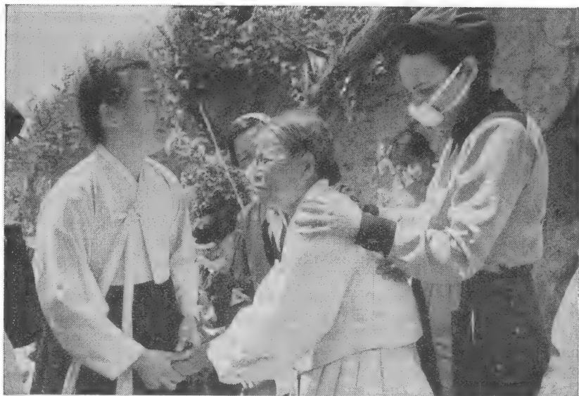
In front of the Cave at Anak where men, women and children were beaten and burnt to death (on the right, the entrance of the cave)

On the way to Sinchen members of the Commission were stopped by peasants whose legs were covered with mud and who were carrying heavy implements. They said that in their district the river was rising and that bodies which had been thrown in months earlier were now coming to the surface. They themselves had been spending the night in trying to rescue the bodies of their fellow countrymen.